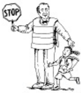
Running to school