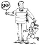
Running to school