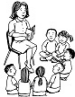
Listening to a story