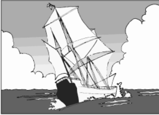
The Mayflower, 1620

During their journey from England to the New World, the Pilgrims spent a long and difficult sixty-six days on a very small ship. Upon reaching land, they were eager to get off the boat. However, they stayed on board long enough to write an agreement known as the 'Mayflower Compact.' They wanted fair and equal laws for the good of the colony.