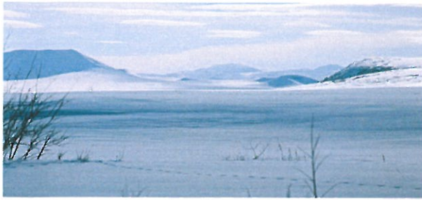
The word " Tundra " means "treeless plain"